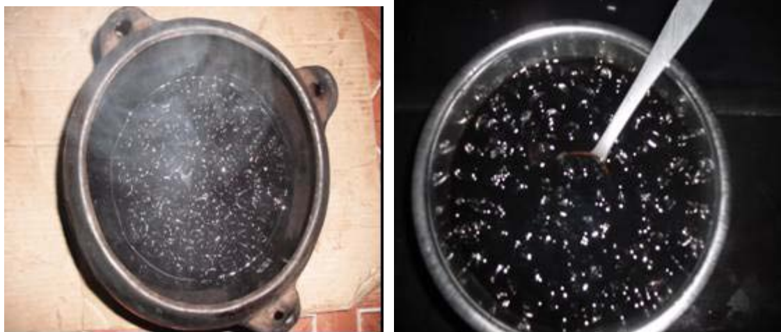
Figure 4. A. Buna qalaa being prepared

Coffee berries are also one of the important components of Oromo traditional food known as Qorii . Qorii is prepared from toasted coffee berries and barley, which is mixed up with refined and spiced butter are used along with the regular coffee. Coffee is also used as a medicine among the Oromo. Primarily it is used for the treatment of discomfort and illness such as a headache. In this regard, a person suffering from a headache is advised to drink cups of coffee. During long journeys, a traveling person takes with him/herself toasted coffee berries. In case the traveler encounters any illness he/she first smells the coffee berries, placing the berries in his/her nose for the betterment of health. If this does not bring change the berries are chewed and swallowed.