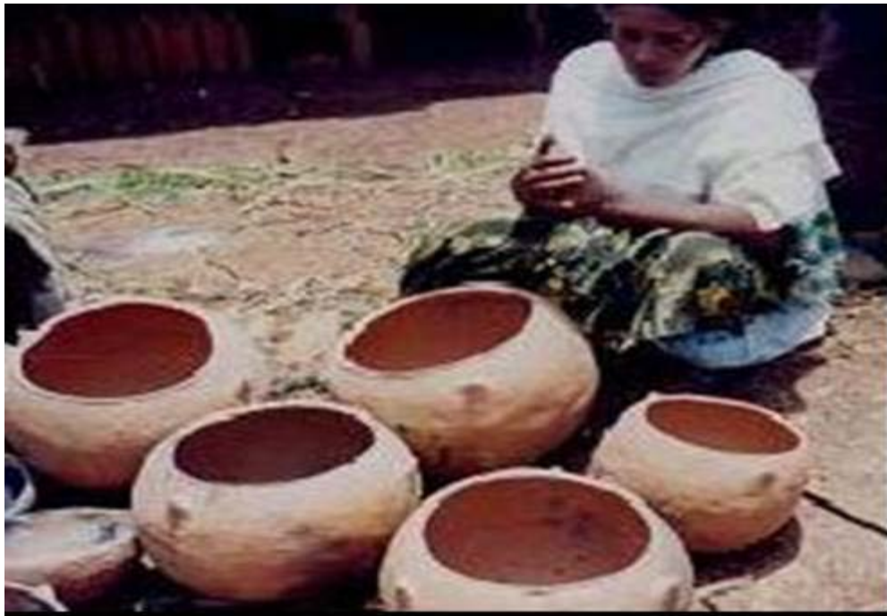
Figure 5. A potter at market for selling waciitii .

sacrifice. In this occasion, the coffee ceremony provides the community with a moment of unity and brings members back to their tradition, their own roots and their own identity. The coffee ceremony is also referred to as a school of socialization because it is during this occasion that the youths are told proverbs, stories, as well as thoughts, customs, and norms of the community. Furthermore, as the coffee ceremony is dominated by women it is an avenue for them to come together, discuss and handle social issues, and share ideas.